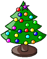
Christmas Diary Dates